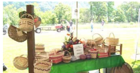
A display of baskets made by participants in IOA's Visually Impaired Program

Thank you so much for ALL you do (seen and unseen)!! Learn more at www.interfaithoutreach.org .